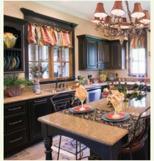
Custom Cupboards of Wichita, Kan., switched its hardwood plywood inventory to 100 percent domestic, CARB-certified material to meet California’s new formaldehyde regulations.

“It was very valuable to have that resource behind us. We asked other companies but nobody else would talk to us in detail.”