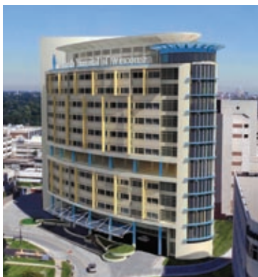
Children’s Hospital of Wisconsin in Milwaukee opened its new 12-story west tower in March 2009.

Chicago’s drive to be one of the country’s leading cities when it comes to sustainable building