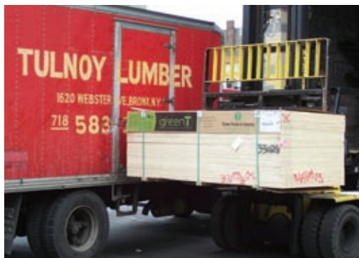
Tulnoy Lumber works with larger suppliers like Timber Products Company to ensure it has a consistent supply of hardwood plywood.

Because most of its business comes from the remodeling and commercial sectors in the northeast, building products distributor Tulnoy Lumber and its sister company, Chelsea Forest Products, didn't feel the housing crunch of 2008. However, when the U.S. financial crisis hit late last year, the 78-year old company that services New York, New Jersey, Connecticut, Massachusetts and Pennsylvania took notice and turned its attention to positioning itself for success.