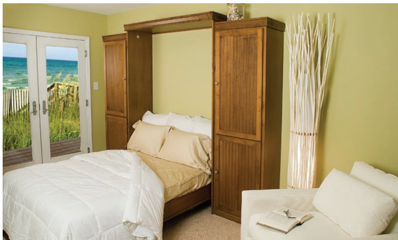
The Bedder Way Co. of Indianapolis is using Timber Products' GreenT hardwood plywood as the base material for many of its pull-down bed designs.